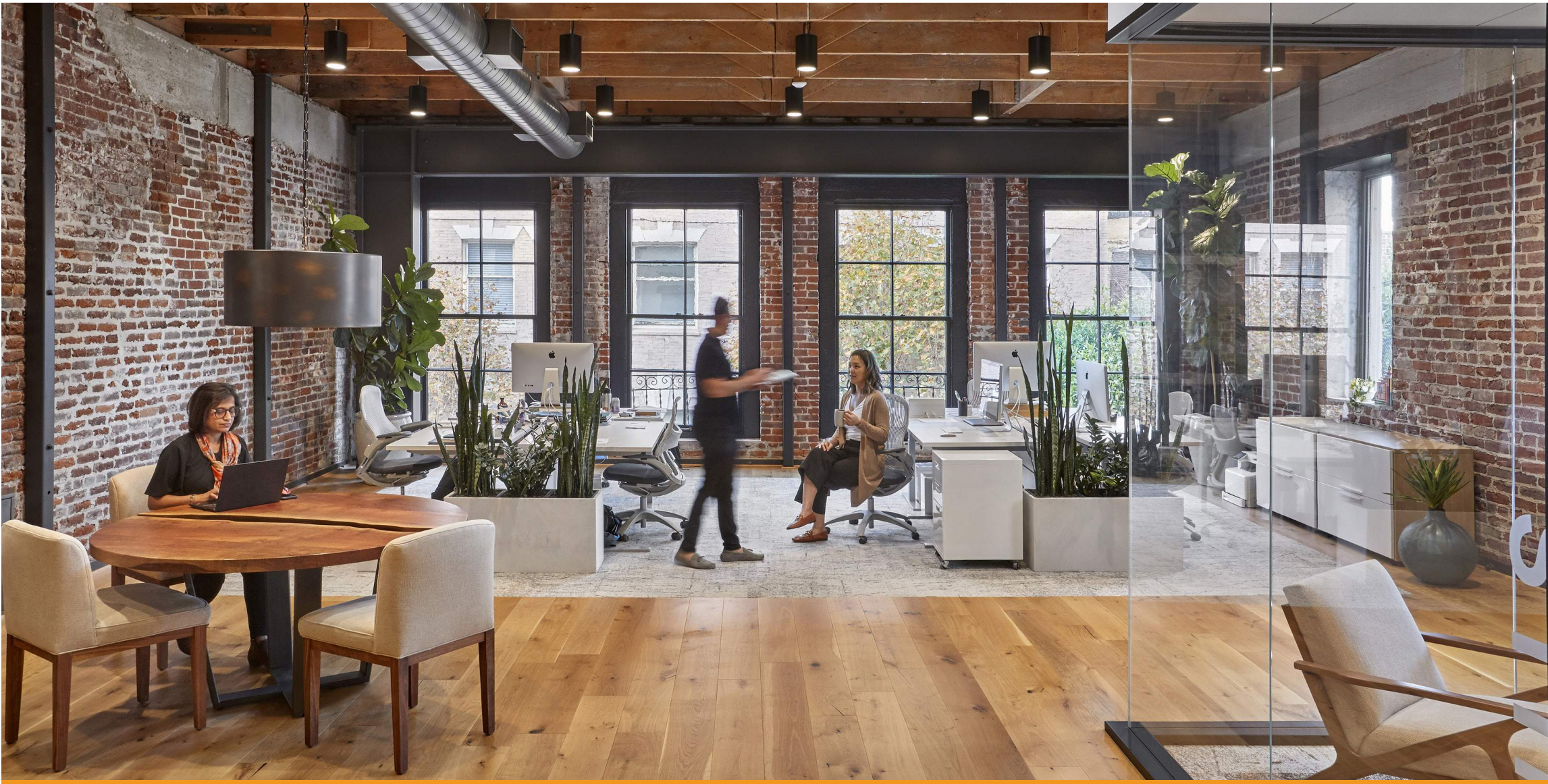
ABOVE: 01 ADVISORS, SAN FRANCISCO CA

Color can also be used to allay fear and anxiety, Guido-Clark continues. In the Covid-minded work environment, she says, “key will be to keep the palette simple, to give it breathing room; think of color and the space as an exhale.” Guido-Clark predicts that as a result of the pandemic we will crave more color in our spaces—“for emotional reasons and for physical wellness. We will be addressing a more heightened sense of emotions and values within the workplace (and in our home offices): countering fear with trust, collaboration as connection, and injecting elements of pure joy.” In order to communicate these feelings, she advises focusing on the qualities of color—“its purity, or the effect due to brightness and saturation”—rather than specific colors. “Mixing warm and cool colors together can reflect collaboration,” she says. “Color is contextual, so play with the combinations