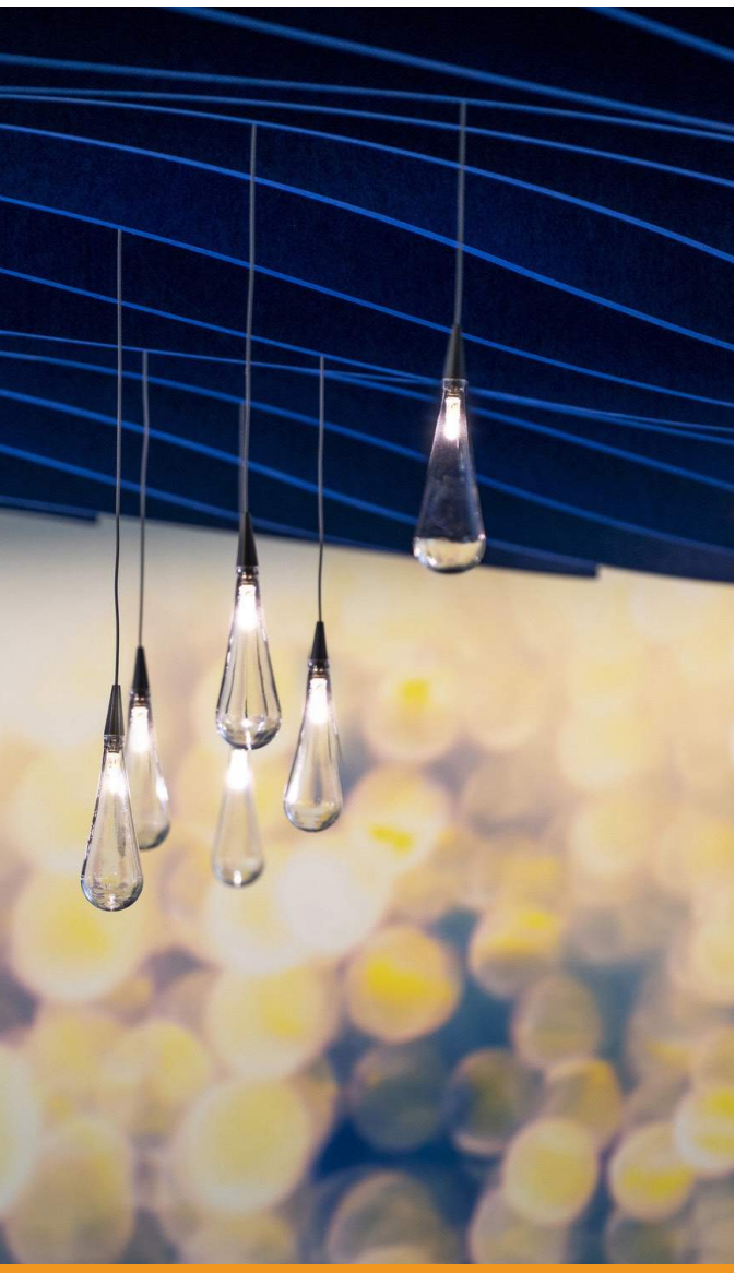
ABOVE: WHOLE FOODS , SEATTLE WA OPPOSITE: HILTON , SINGAPORE