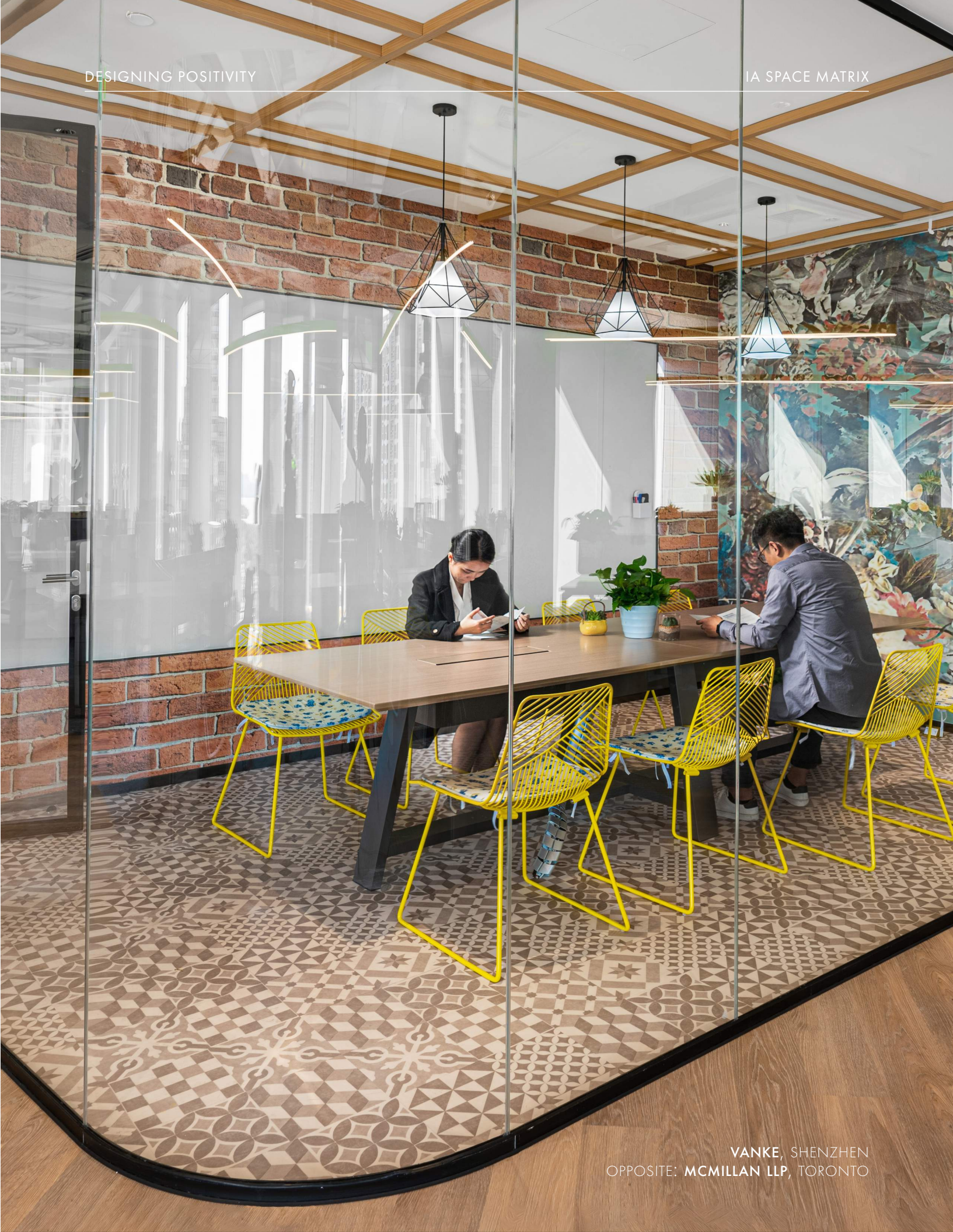
VANKE, SHENZHEN OPPOSITE: MCMILLAN LLP, TORONTO