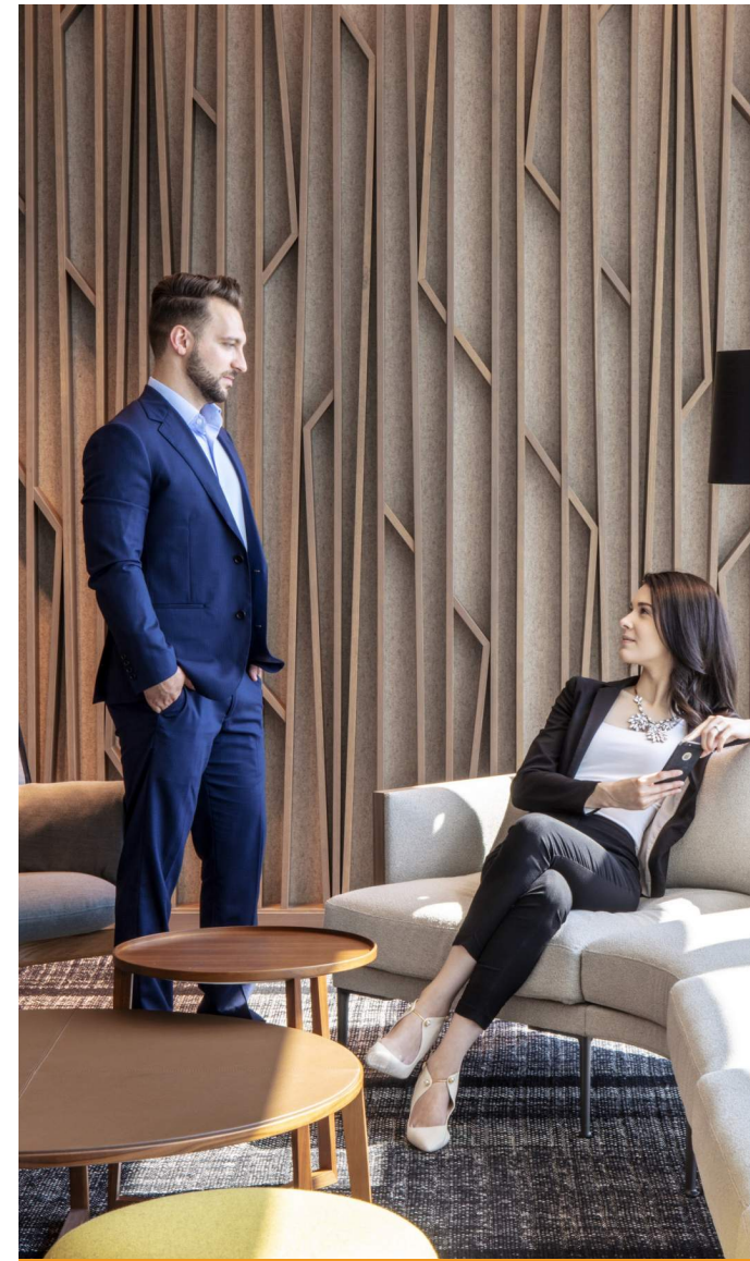
ABOVE: TROUTMAN PEPPER , RALEIGH NC OPPOSITE: HILTON , SINGAPORE

Our mental performance is improved and our stress level lowered in biophilicly designed spaces. 18 Deploying design principles and elements that would have been found in natural spaces where we flourished in our prehistory addresses human comfort at a fundamental, neurological level and help end users feel safe. “Biophilia speaks to the essence of being human, of being connected to a natural world that honed our minds and behaviors in our evolutionary past—a mind that uses nature not just for survival but also for emotional and social well-