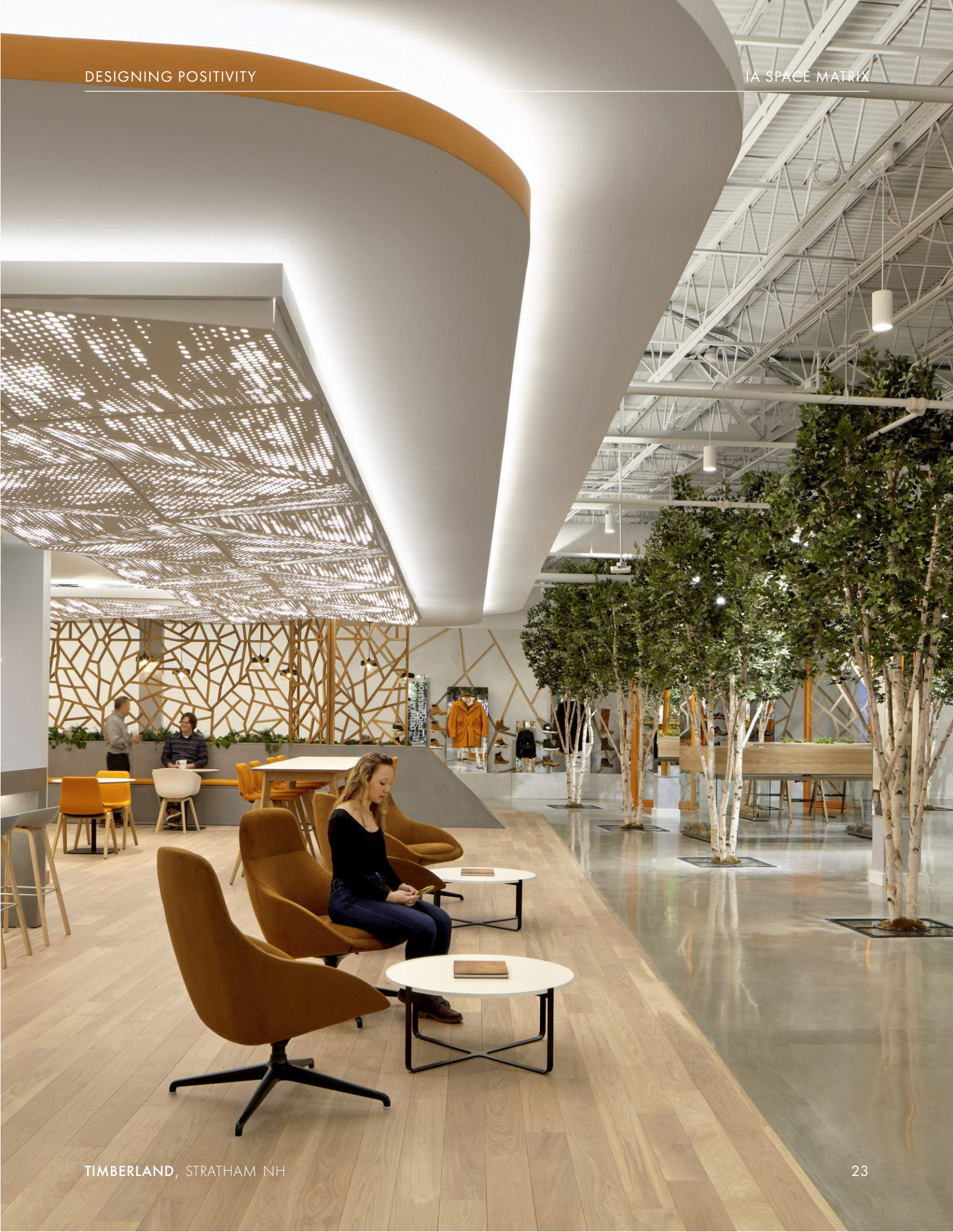
TIMBERLAND, STRATHAM NH