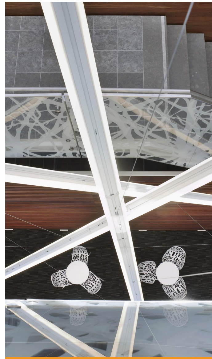
ABOVE: MGM PICTURESS , BEVERLY HILLS CA OPPOSITE: CAPITALAND ASCENDAS PLAZA BRIDGE+ , SHANGHAI