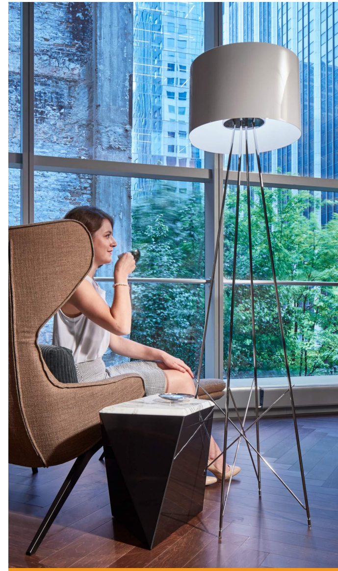
ABOVE: JOHN BUCK COMPANY, CHICAGO IL OPPOSITE: VANKE, SHENZHEN

Moving forward, workers are likely to have more choice about how often they go to the office. Making the workplace a destination that people want to go to requires that it be designed holistically and with intentionality—to enable physical, functional, and psychological comfort.